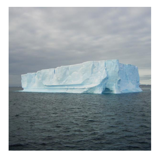
Fig. 1: The behavioural slant of most policy initiatives is not visible.

Indeed, if BIAP 2016 were to give account of behavioural policy applications strictu sensu only, it would provide a conservative picture. It would be the equivalent of describing an iceberg by pointing just to its emerged part. Instead, the report gives account of the wealth of policy applications that are either implicitly or explicitly informed by BIs. In doing so, it unveils the part of the iceberg that is not visible from the surface.